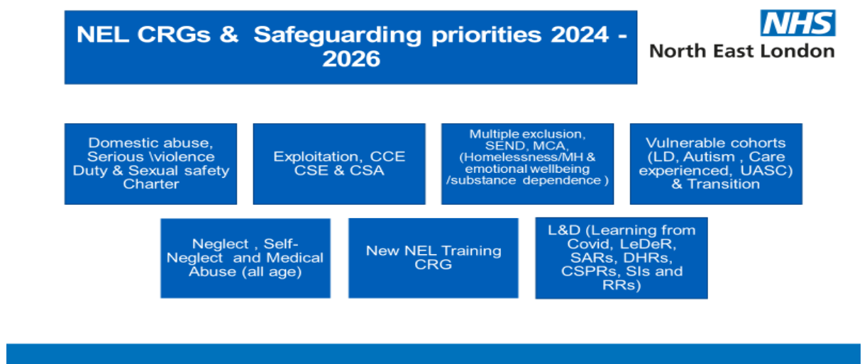
Figure 2 - Clinical Reference Groups (CRGs)